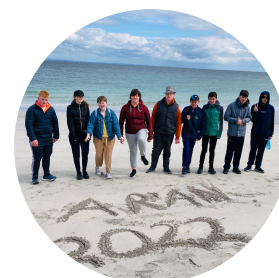
Trips & Excursions