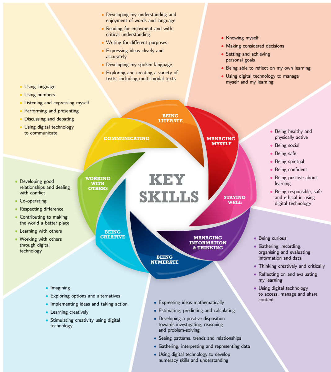
FIGURE 2 JUNIOR CYCLE KEY SKILLS

In addition to their specific content and knowledge, the subjects and short courses of junior cycle provide students with opportunities to develop a range of Key Skills. Figure 2 below illustrates the key skills of junior cycle. There are opportunities to support all key skills in this course, but some are particularly significant.